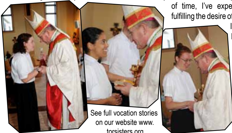
See full vocation stories on our website www.torsisters.org

After graduating from Franciscan University of Steubenville in 2010, the Lord led me here to Toronto. I was drawn by the joy of all the sisters, their love for Christ crucified, and my own desire to give my life to Him. Since I arrived, I have experienced that joy and that love and have been able to share it with my sisters and everyone I encounter in ministry. I love visiting the elderly and bringing Jesus to them in the Eucharist, but I also bring His joy and His love just by smiling and talking with them. Love doesn't have to be given in big packages or through heroic deeds. We just need to say Yes to the Lord in the little things each day.